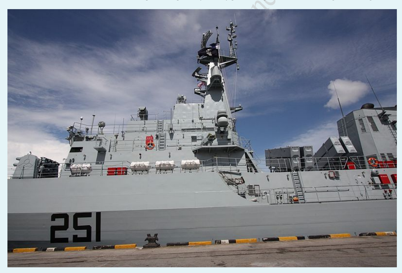
The side of the PNS Zulfiquar, a Pakistan Navy frigate. This picture was taken during the ship's goodwill visit to Port Klang, Malaysia, in August 2009.

Pakistan's naval leadership will also be aware of the risks and financial costs of developing and operating a nuclear submarine—the need to constantly refine equipment and train personnel; of razor-sharp communications and command and control systems; and the requirement of mastering safety procedures. In the final analysis the SSBN is not an asset if it is not mastered well and operated optimally. Merely possessing one offers no strategic advantages. \square