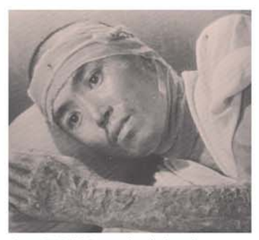
Over 340,000 people died and generations were poisoned as a result of the atomic bombs dropped on Hiroshima and Nagasaki

Securing our Survival (SOS) The Case for a Nuclear Weapons Convention, 2007