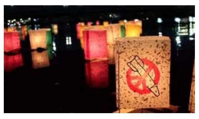
Hiroshima lanterns

TOKYO (IDN) - The mere fact that the two-day foreign ministerial meeting of the 12-nation coalition of non-nuclear states took place in the Japanese city of Hiroshima, gives the clue to its symbolic significance. Being the first city in the world to witness the horrors of atomic destruction, Hiroshima, from that very fateful day almost 70 years ago, remains at the forefront of global efforts to learn about the devastating impact weapons of mass destruction can cause and also serves as a reminder of the necessity of eliminating nuclear weapons. That symbolic gesture of holding the meeting in Hiroshima on April 11-12, 2014 received added value as the ministers listened to the stories of atomic bomb survivors before starting their formal discussion.