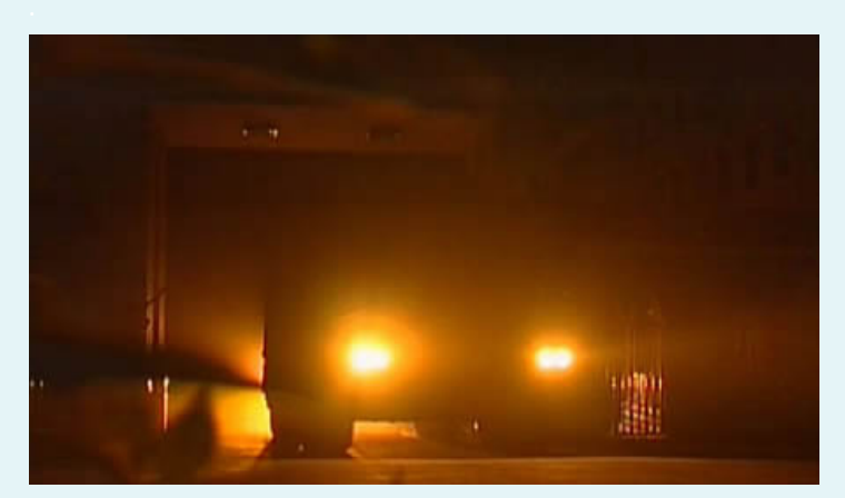
A Chinese mobile missile launcher, possibly for the DF-11 or DF-15 SRBM, emerges from an underground facility at an unknown location.

The Pentagon report states that China has "developed and utilized UGFs [underground facilities] since deploying its oldest liquid-fueled missile systems and continue today to utilize them to protect and conceal their newest and most modern solid-fueled mobile missiles." So it is not new but it is also being used for modern missiles.