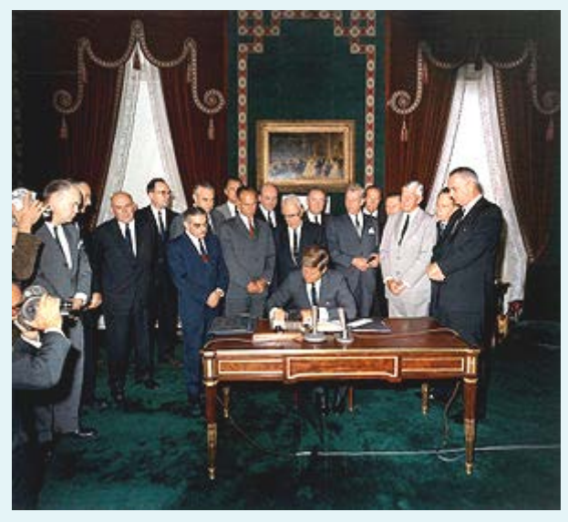
President Kennedy signing Nuke Test Ban Treaty in 1963

TOKYO, Aug 15, 2011 (IDN) - When the world commemorates the International Day against Nuclear Tests for the second time on August 29, it would have reasons to rejoice at the progress made toward a nuclear-weapon-free world, and at the same time take note of roadblocks ahead before that goal is achieved.